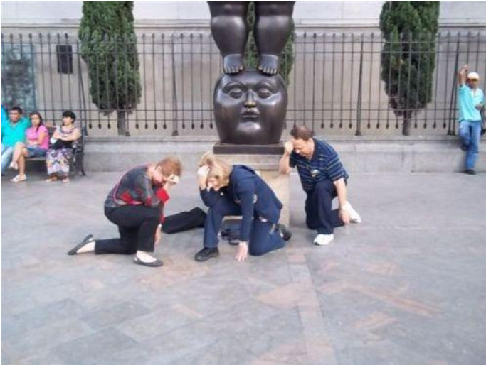
Medellin, Colombia, S.A. November 2011 Assembly

Our fellow OAers in Medellin were able to vividly demonstrate through music, dance, and artistry the true nature of our disease and the path to recovery! I get chills just remembering it! We had some fun too, as the picture below will testify, as some of us engaged in what turned out to be a worldwide craze regarding a certain professional football player who shall remain nameless-outside issue!!