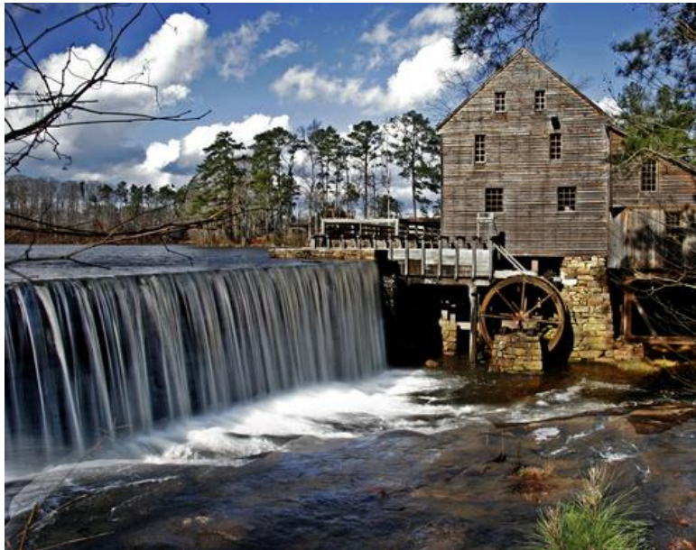
The old Yates Mill Pond in Raleigh

WELCOME TO OVEREATERS ANONYMOUS, WELCOME HOME